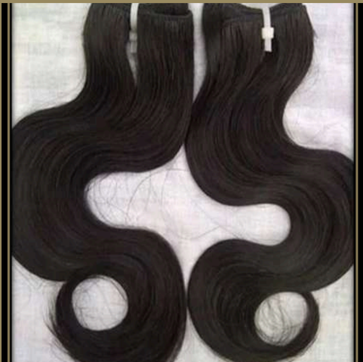
Body Wave Weft Hair