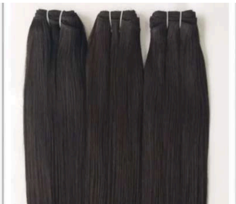
Straight Weft Hair