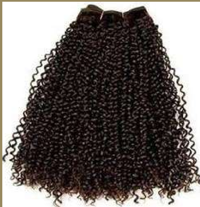
Curly Weft Hair